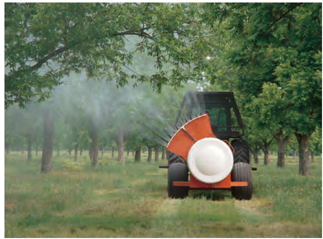
Fig. 11. Air-blast sprayer used for treating pecan orchards for pecan weevil and other pests.

Treatment Application. Once a threshold is reached in an orchard or grove, treatment should be applied with an airblast sprayer calibrated to deliver 75–100 gallons of spray mixture per acre (Fig. 11). Airblast sprayers come in a range of sizes. Large sprayers can allow deposition to the tops of trees in excess of 60 feet and provide excellent coverage to the entire canopy, provided the grower takes specific application precautions (Sumner 2004). To ensure penetration and thorough coverage, commercial growers are encouraged to treat both sides of each tree while traveling at the proper speed (1.5 mph). Even large air blast sprayers may have their limitations when address-