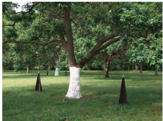
Fig. 9. Pyramid trap.