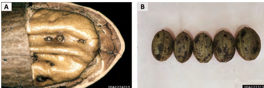
Fig. 6. Pecan weevil damage after the liquid endosperm has begun to harden results in; A) black spots on the kernel indicative of pecan weevil feeding or B) degradation of the gel resulting in “sticktights”.

Limb Jarring. The first method described for sampling and to some extent controlling pecan weevil is limb jarring (Swingle 1935, Bissell 1939). With this labor-intensive approach, tarps are set within the drip line and limbs are beaten with a padded pole to dislodge, capture, and count adult weevils. Swingle (1935) reported that five men using two sheets could jar 15–30 trees per hour for three to 10 cents per tree, depending on tree configuration (low spreading versus high top-worked trees). The process would be repeated three more times at a cost of 12–40 cents per tree per season to obtain 60–85.8% control (Swingle 1935). The advent of insecticides and application equipment after WWII allowed jarring to be used as a monitoring tool to signal treatment. Several authors suggested, but did not experimentally prove, that jarring five or more weevils from a tree constituted an action level that warranted an insecticide application (Phillips et al.