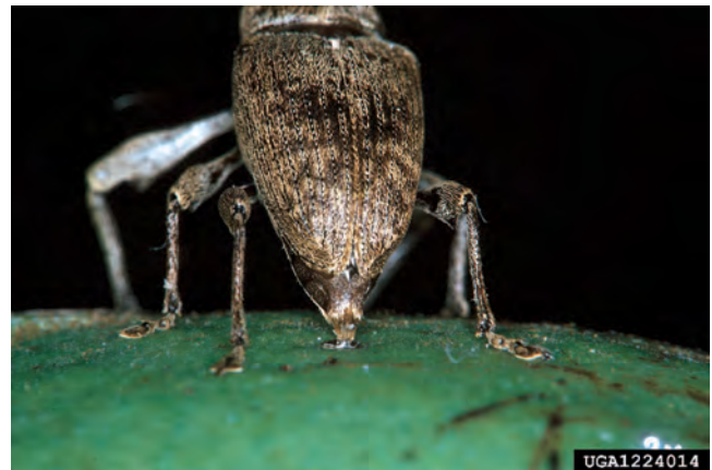
Fig. 3. Female weevil with ovipositor extending through the shuck and into the nut.

Larval Description and Development. Pecan weevils exhibit four larval instars (Sterling et al. 1965). Development times for instars 1–3 average 3.9, 3.7, and 6.5 d, respectively, and fourth instars may feed for 5–9 d but do not emerge from the nut until an average of 20.3 d have passed (Fig. 1b) (Harris and Ring 1979). This disparity between emergence and when feeding ceases among fourth-instar larvae may