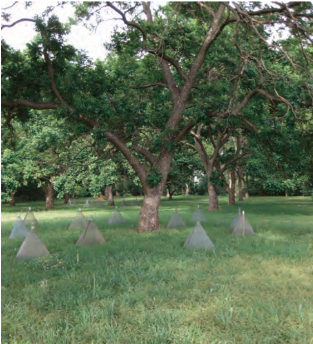
Fig. 8. Wire cone emergence traps.

Orchard History Infestation Records. The biology and population dynamics of pecan weevil provides a method to assess current-season