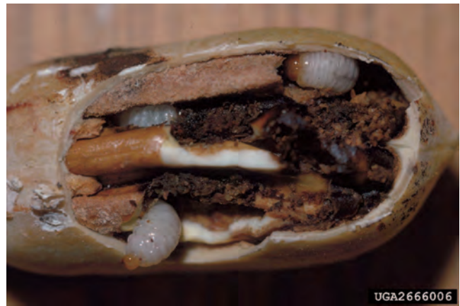
Fig. 7. Destruction of the entire pecan kernel from inside the nut by larval pecan weevils.

Female weevils typically avoid attacking previously infested nuts (Aguirre 1979, Harris and Ring 1979), however, Smith and Mulder