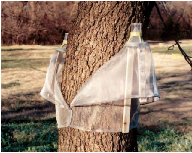
Fig. 10. Pecan Circle trap. In this picture, two traps encircling the tree are used to trap all weevils crawling up the pecan trunk.

risk. The pecan weevil increases \approx five-fold per generation and disperses very little unless trees in the immediate vicinity are devoid of fruit (Raney and Eikenbary 1968, 1971; Calcote 1975; Harp and Van Cleave 1976b; Harris et al. 1981a). Maintaining good harvest records, including data on yield and percent infestation by pecan weevil, allow a ballpark estimate ( \pm 25\% ) of pecan weevil risk for future harvests. By multiplying the number of infested nuts per unit area that occurred 2 yr ago by five you can estimate the number of nuts expected to be at risk in the same orchard or grove in the current season. The value of the nuts at risk is dependent on the current price they are expected to bring at harvest and this is compared with the expected costs of pecan weevil management to assess whether treatment is warranted.