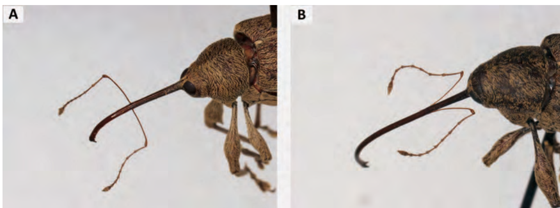
Fig. 5. Pecan weevil adults showing insertion point of antennae on rostrum. (A) Male; (B) Female.

Pecan weevils start laying eggs in early-maturing nuts and early-emerging weevils are capable of surviving until the crop is suitable for oviposition (Criswell et al. 1975). The average longevity of postemergent adults is 15–30 d (Harris et al. 1981a); however, female weevils emerging beneath large-seeded cultivars can live for up to 56 d (Van Cleave and Harp 1971, Criswell et al. 1975). Generally, females live longer than males and those that emerge early in the season live longer than those that emerge later (Criswell et al. 1975, Harris et al. 1981a). After emergence, pecan weevils enter the tree by either crawling up the bole or flying directly to the canopy or bole (Raney and Eikenbary 1968, Mulder et al. 2003). Raney and Eikenbary (1968) showed in a capture–release study that the majority of weevils flew to the bole. Cottrell and Wood (2008) found that newly-emerged weevils predominantly crawl up the bole to enter the canopy and search for viable fruit. This explains why traps affixed to the bole are more efficient at capturing weevils than other trap types (Mulder et al. 2003). Weevils initially enter the canopy to search for food and oviposition sites; if no pecans are found or if many nuts are already infested within the orchard where the beetles emerged, they may fly to adjacent trees or