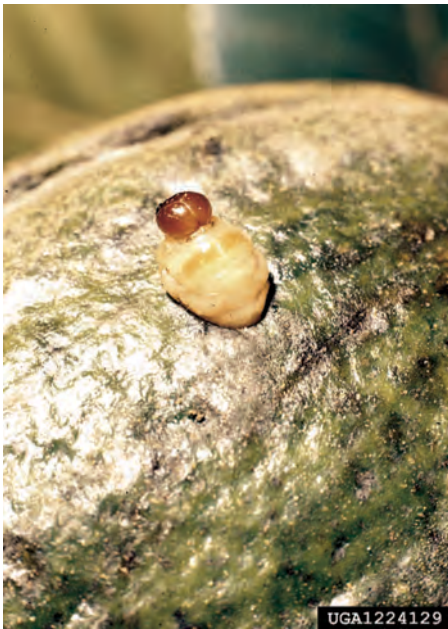
Fig. 4. Fourth-instar pecan weevil larva exiting a nut.

earthen cell, and remain in diapause until they pupate in late summer of the next year or the year after that. Most weevil larvae exhibit little to no lateral movement upon entering the soil and hence, occur primarily within the drip line associated with the host tree (Bissell 1931, Chau 1949, Tedders and Osburn 1971).