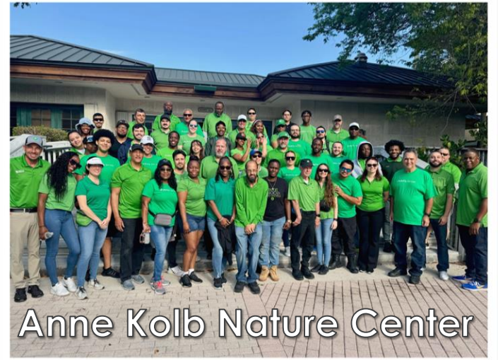
Anne Kolb Nature Center

Corporate and student groups are welcome. Participation in EcoAction Days can be used toward high school community service hours. Contact site coordinator for group information and preregistration.