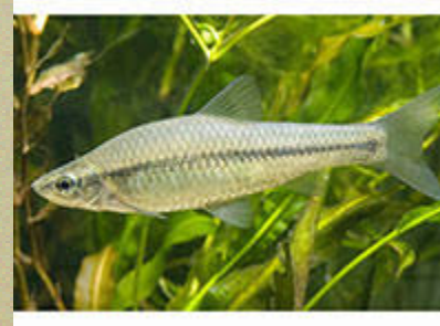
Stone moroko = elevated