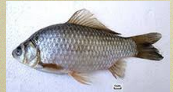
Prussian Carp = elevated