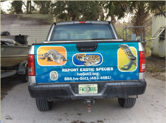
Water Matters Day, Tree Tops Park