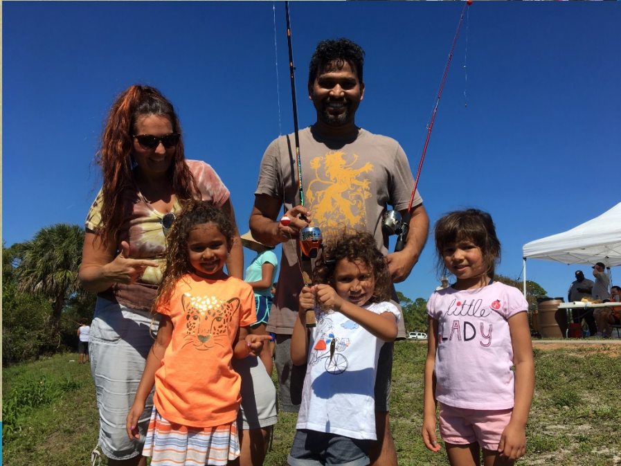
Outdoor Adventure Day, Lake Ida