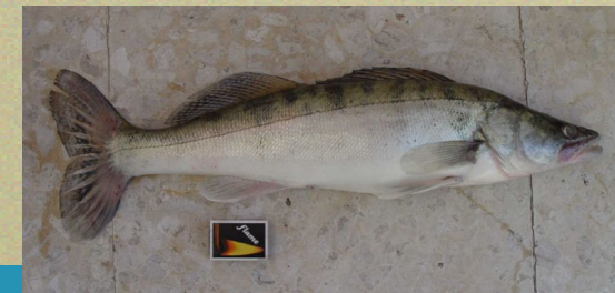
Zander = low