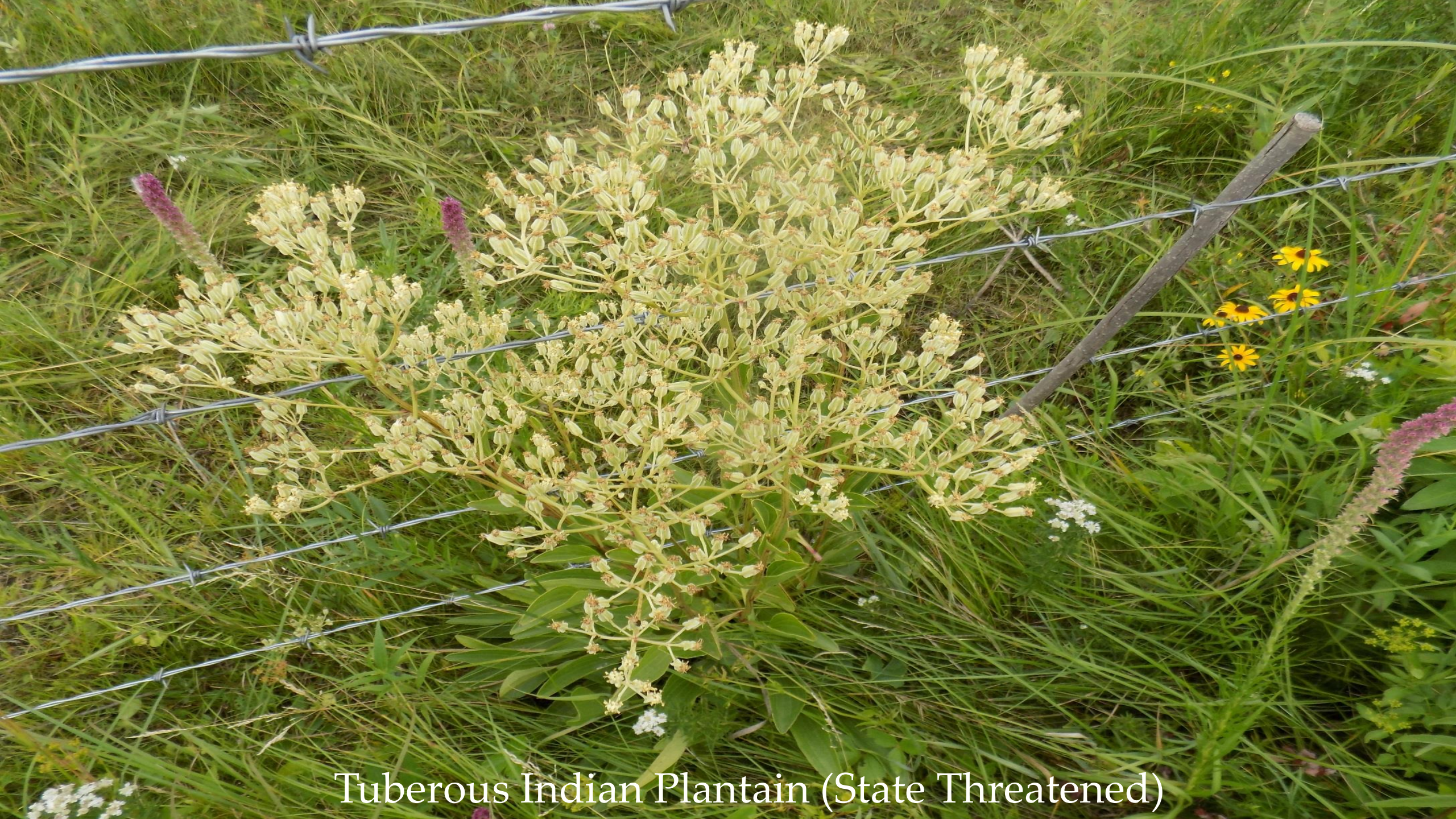
Tuberous Indian Plantain (State Threatened)