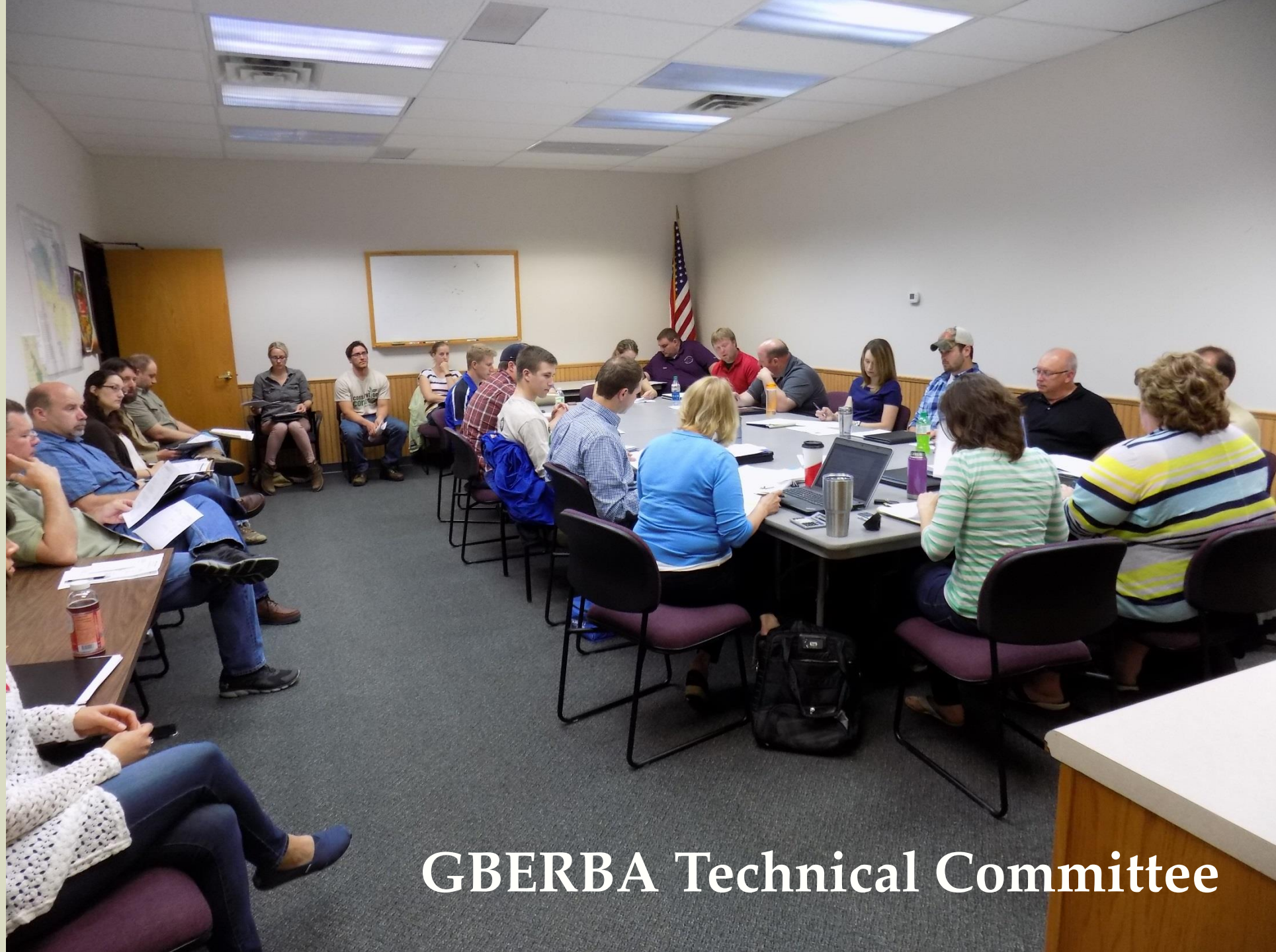
GBERBA Technical Committee