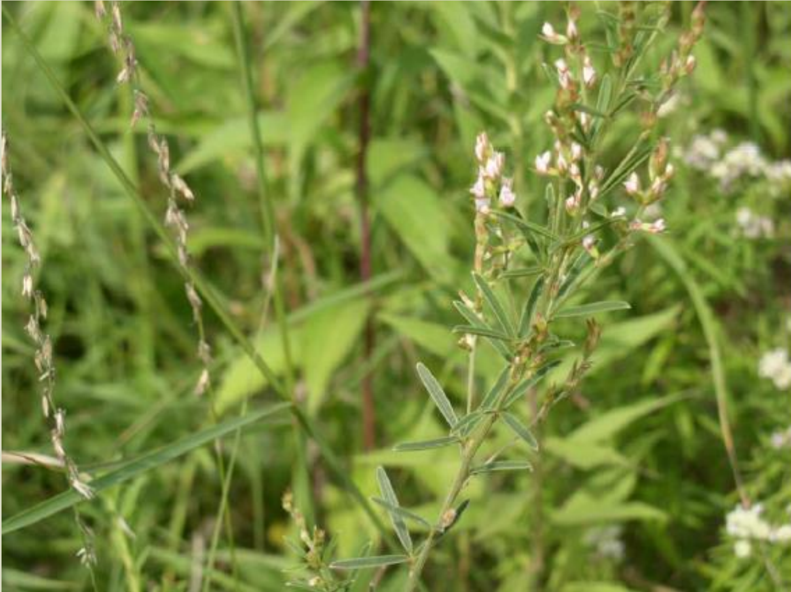
Prairie Bush Clover (Federally Threatened, State Endangered)