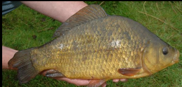
Crucian Carp