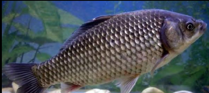
Prussian Carp