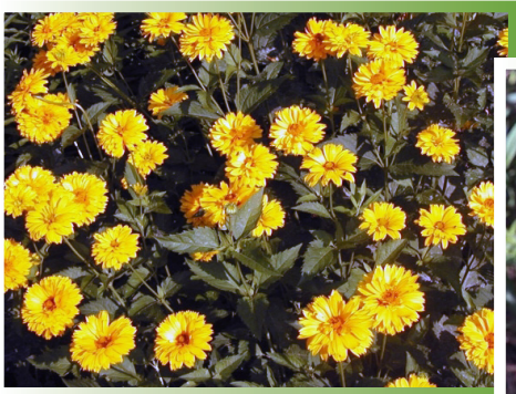
oxeye ( H. helianthoides ), Dow Gardens