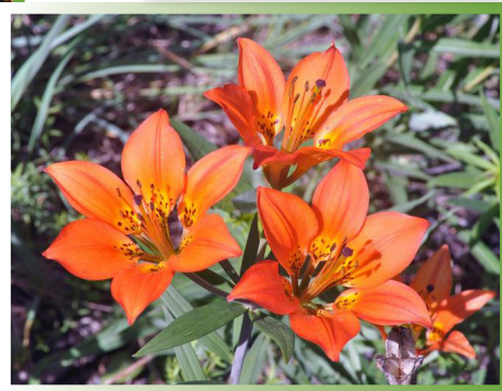
wood lily ( L. philadelphicum)