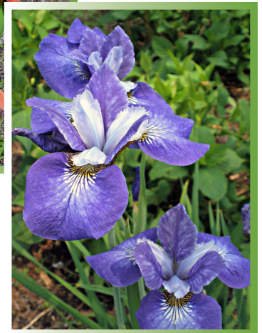
harlequin blueflag ( I. versicolor ), A. Oommen