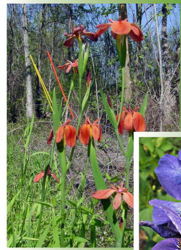
copper iris ( I. fulva)