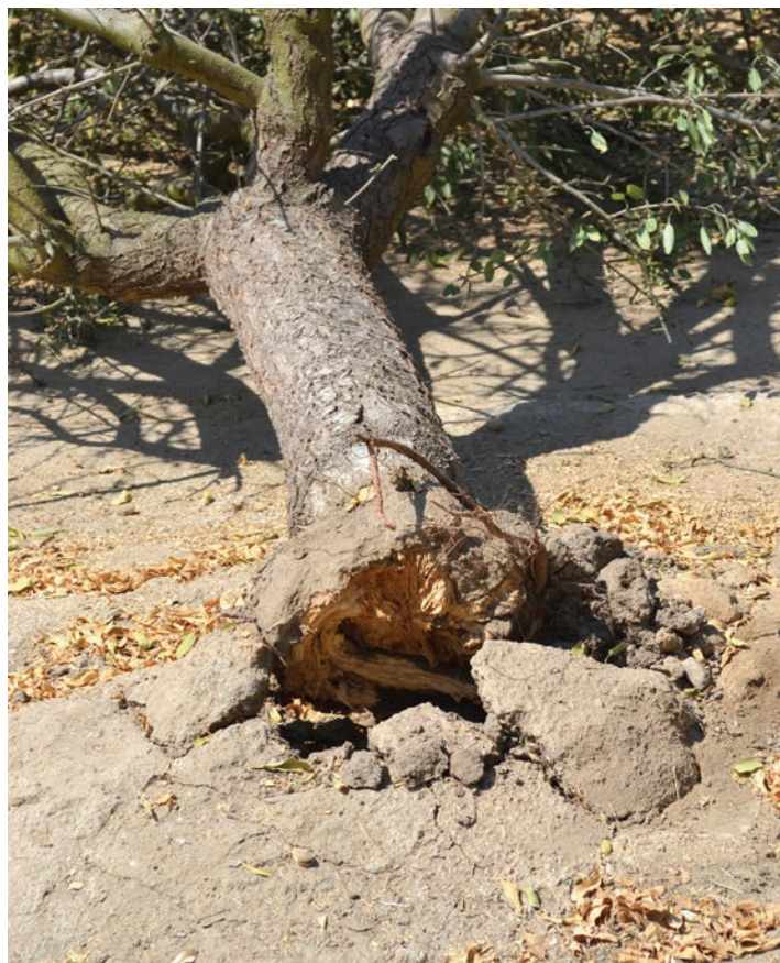
Windfall caused by Ganoderma butt rot.

This article first appeared in the spring 2017 issue of the Western Plant Diagnostic Network First Detector News, volume 10, issue 2. Read more First Detector articles like this at www.npdn.org/wpdn/newsletters .