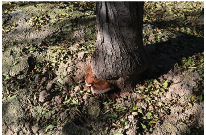
Active Ganoderma adspersum conk, notice bright white edge and reddish spores covering top surface.

Butt rot is the most poorly understood of the wood decay types associated with almond and perhaps the most important. Butt rot fungi affect the below ground portion of the trunk from which the roots diverge. These fungi decay the tree from the bottom up and from the inside out, rarely extending more than 12–18" above the soil line. There may be no obvious symptoms and the tree will still flower and set a crop. However, some trees with extensive decay may show a general loss of vigor. Fruiting structures (see photo) may occur at or near the soil line. Eventually infection leads to wind-driven collapse (windfall) with the tree